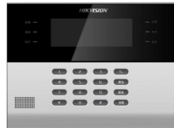
DS-19A08N-F/K1 or DS-19A08N-F/K1G

The control panel is mainly applied to shopping malls, stores, residences, apartments, communities and so on. It can push the real-time alarm information to the mobile app and implement the function of remote arming/disarming.