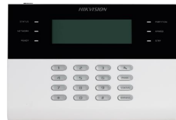
DS-19A08N-F/K2 Or DS-19A08N-F/K2G